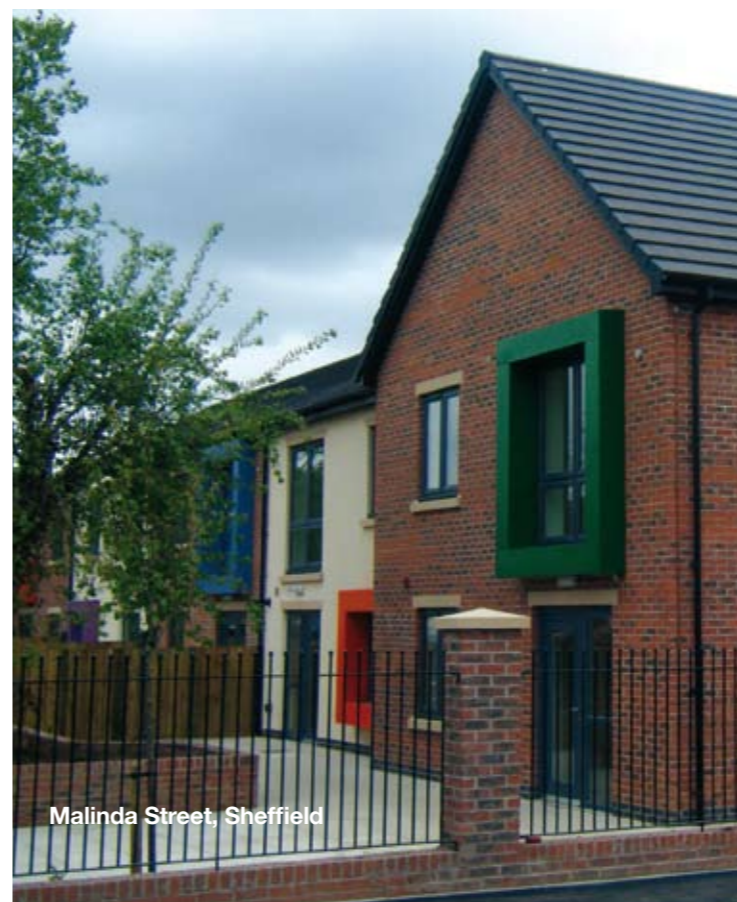
Malinda Street, Sheffield

We have also nearly finished building two supported housing schemes at Grimesthorpe Road and Malinda Street in Sheffield. They are made up of 21 apartments for people with learning disabilities and 4 apartments for people with physical disabilities. Many of the new residents have been involved in the project from the start and have been able to follow the progress of the build from the laying of foundations, through to completion.