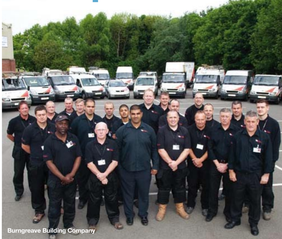
Burngreave Building Company

As most of you will know we use contractors to do repairs and maintenance work, as well as our own Direct Services Organisation (DSO).