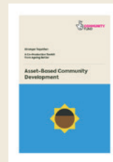
5 Asset-based community development