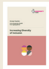
7 Increasing diversity of inclusion