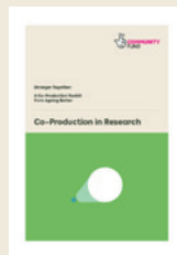
8 Co-production in research