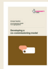
9 Developing a co-commissioning model