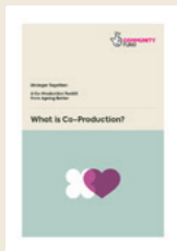
2 What is co-production?