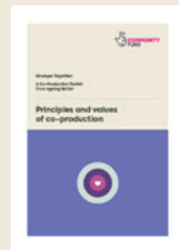
3 Principles and values of co-production