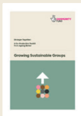
6 How to grow sustainable groups