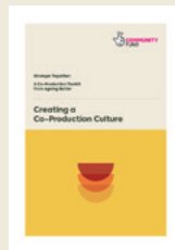
4 Creating a co-production culture