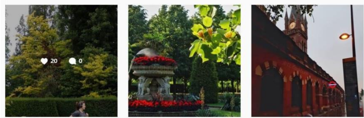
Some images from Celia's Instagram page

old photos. I also have been teaching myself how to use Instagram hashtags (#) to reach wider audiences.